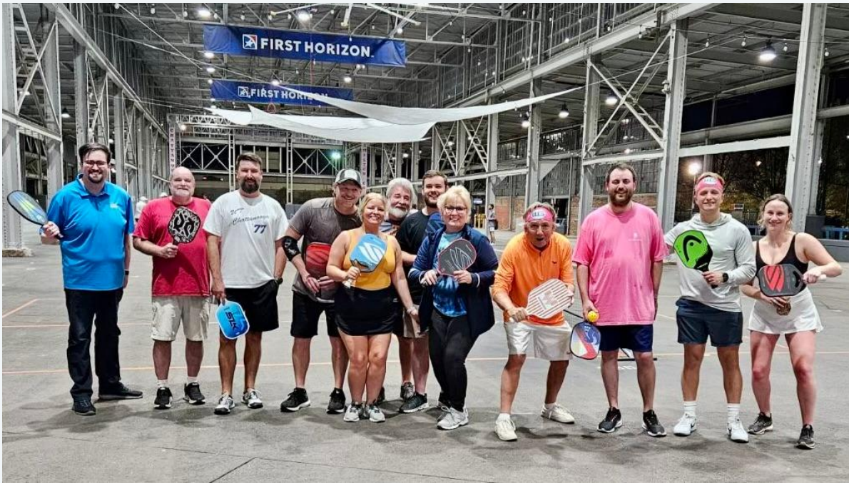
Dink for a Cure Pickleball Tournament benefiting The American Cancer Society.