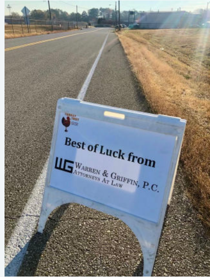
Turkey Trot and Dare to Dance with The Kidney Foundation!