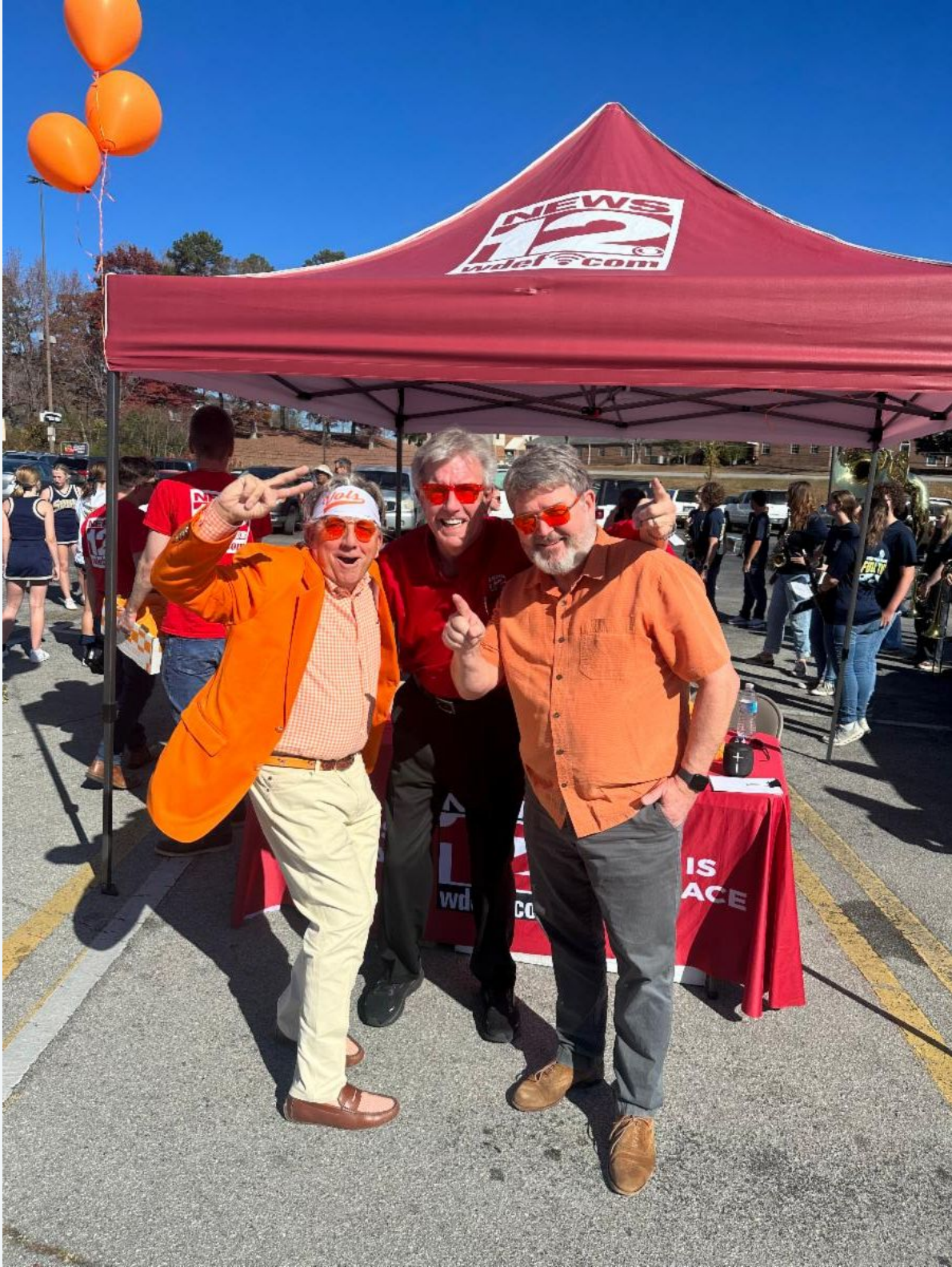
Solid Orange Drive-Thur and Vols vs. Bama at The Ooltewah Whistlestop