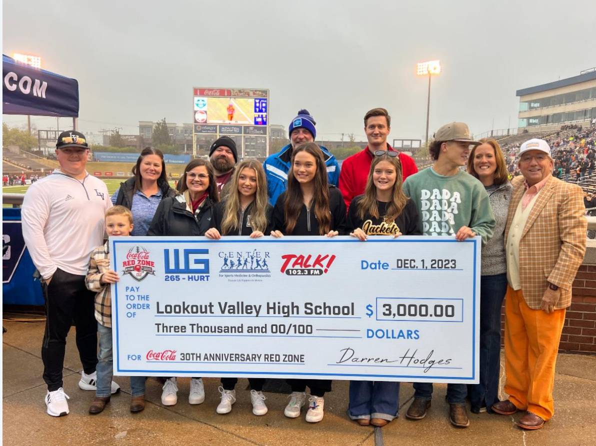
Blue Cross Bowl Sponsors with Talk Radio and the Coca-Cola Red Zone.