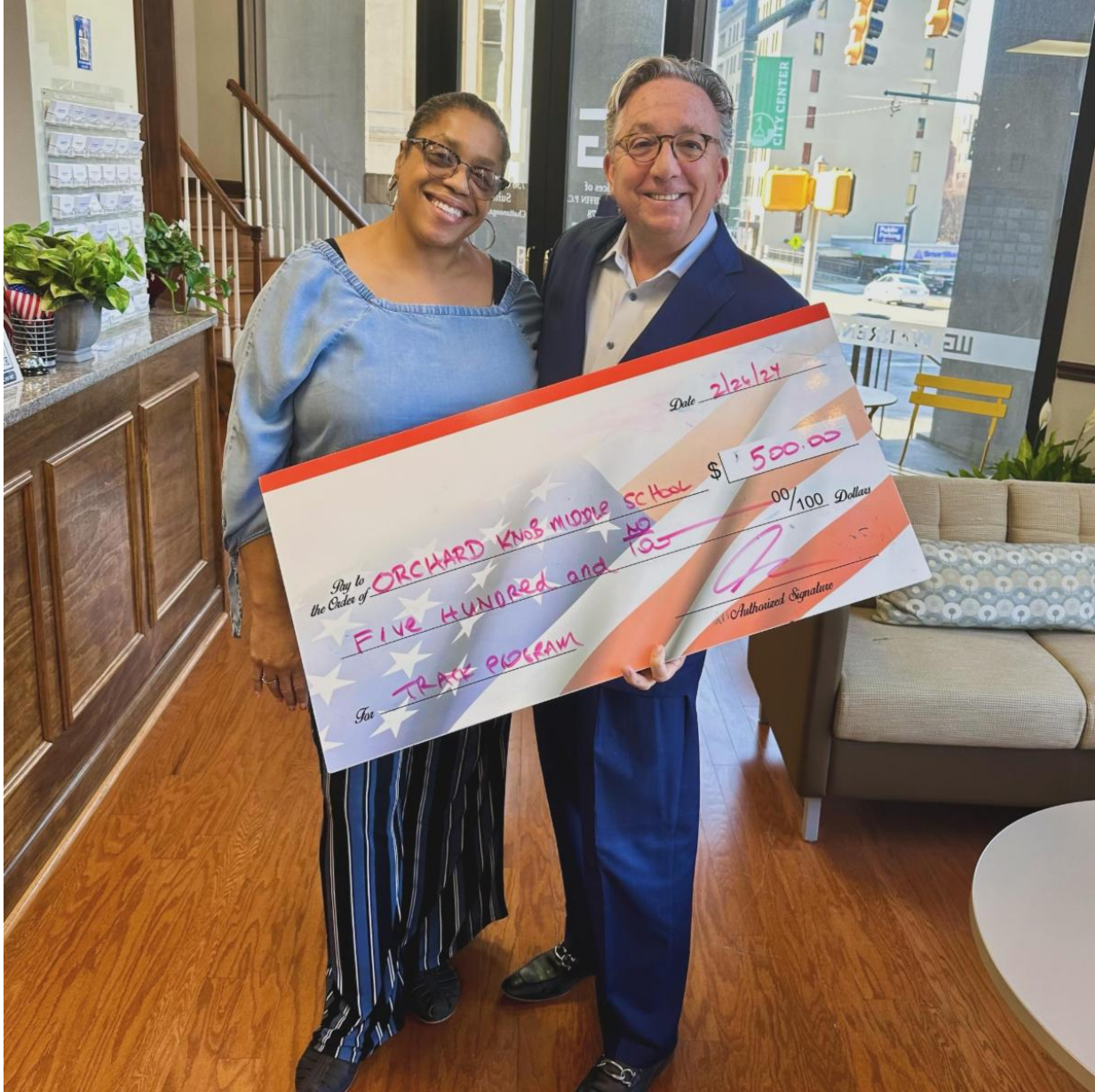
Orchard Knob Middle School Track Program