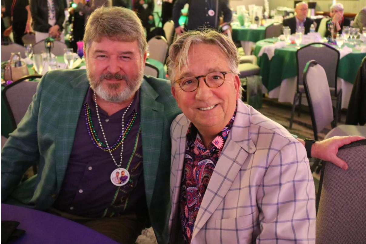
Chambliss Center for Children Mardi Gras Gala Sponsors