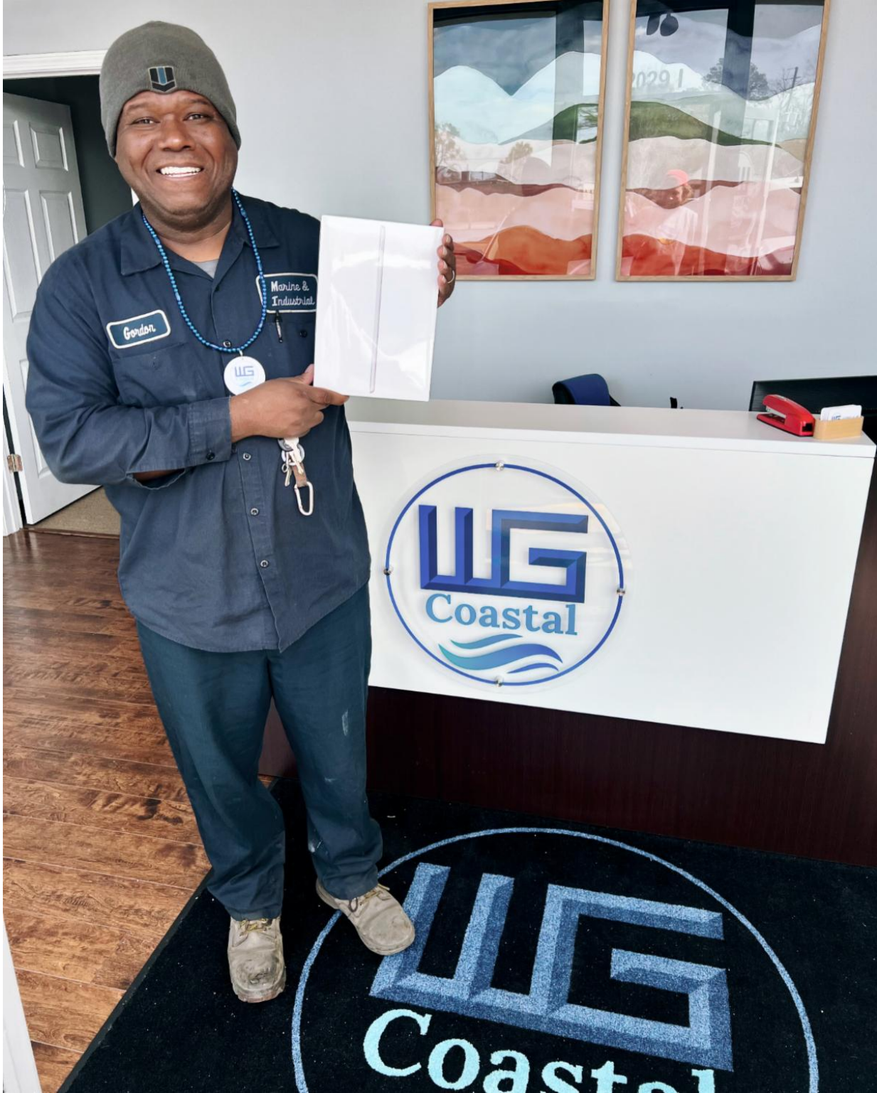
Fat Tuesday Giveaway - Winner of a New 64GB iPad!